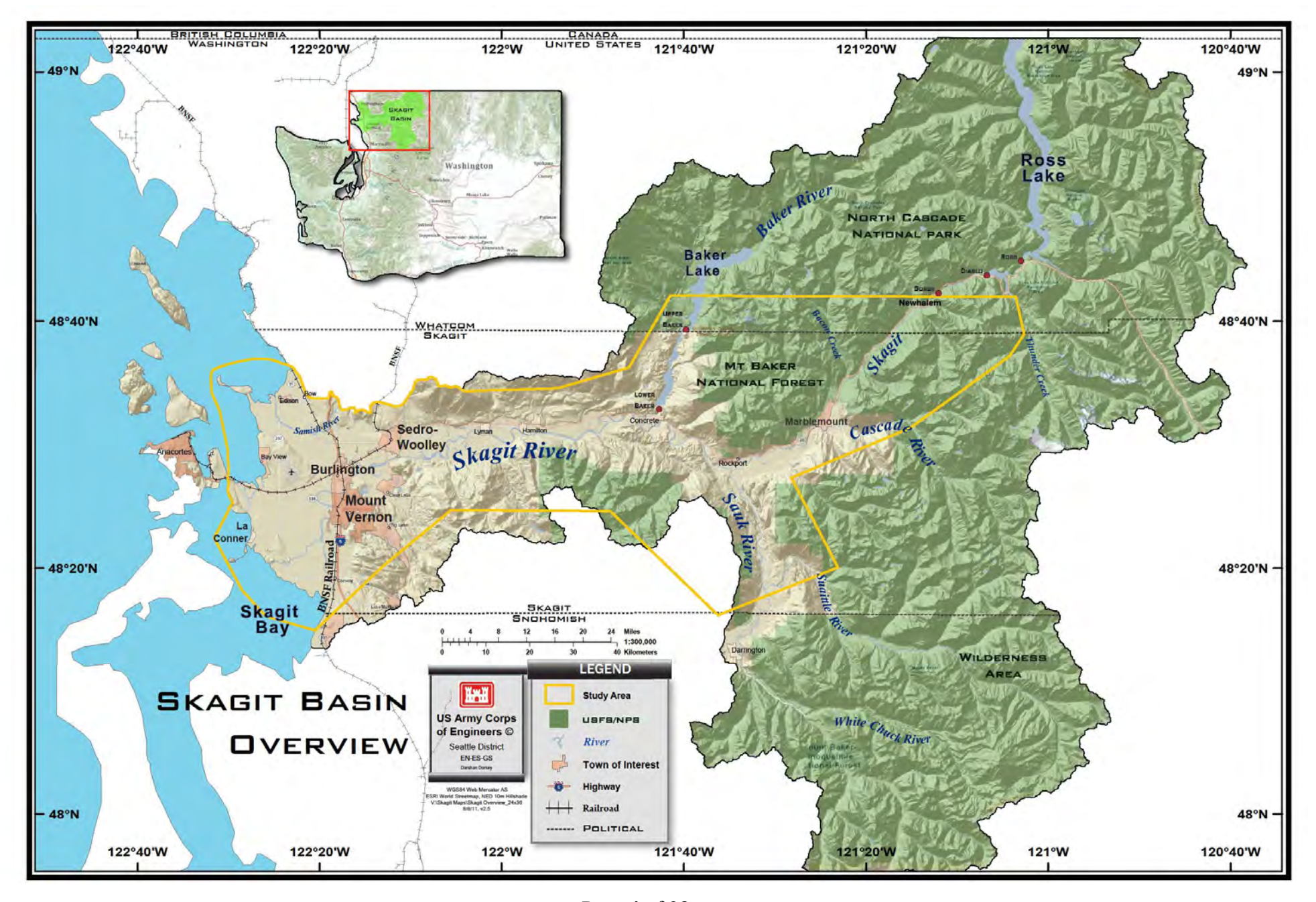
Page 4 of 23