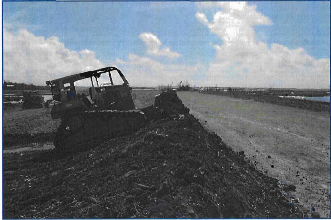
Show Caption